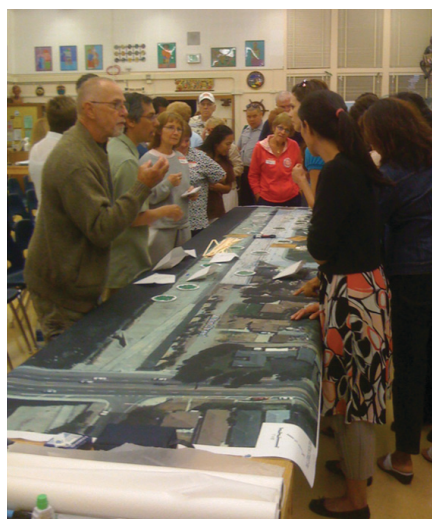
Public workshop on design alternatives

This 1.2-acre linear urban park alongside the Ballona Creek Bike Trail incorporates numerous green-design elements, including the use of porous paving and recycled materials, native planting, storm water capture and treatment, promotion of alternative transportation, and creation of an interpretative ecological habitat for birds, insects, and reptiles. A variety of special elements—bird-watching platforms, bike trail enhancements, seating areas, and outdoor picnic areas—enhance visitor experience along the park, which stretches over 1,000 feet in length and averages 45 feet wide.