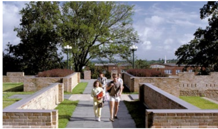
+ Sam Houston State University, Old Main Restoration Huntsville, Texas