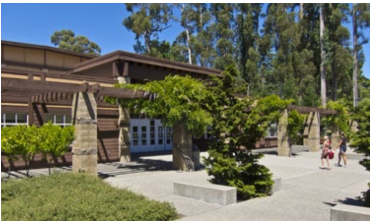
+ Dominican University San Rafael, California