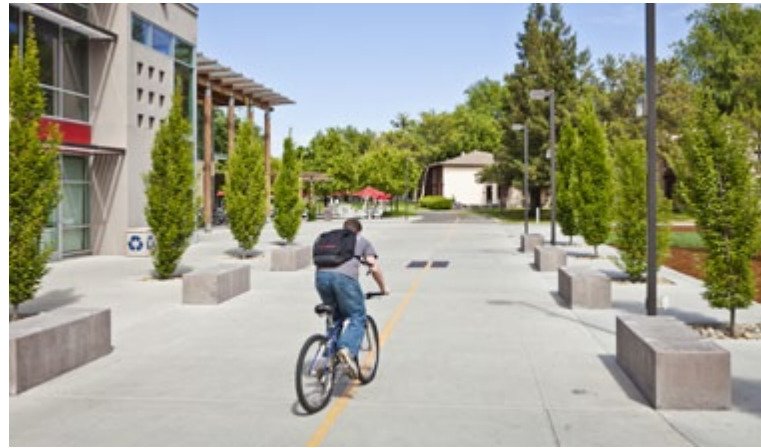
+ UC Davis Tercero Student Housing Davis, California