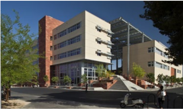
+ UNLV Greenspun College of Urban Affairs Las Vegas, Nevada