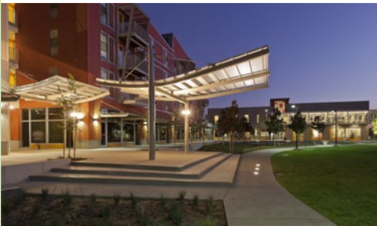
+ UC Davis West Village Davis, California