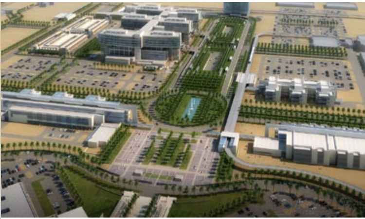
+ King Saud Bin Abdulaziz University (KSAU) Riyadh, Saudi Arabia