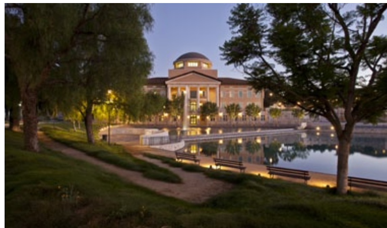
+ SOKA University of America Aliso Viejo, California