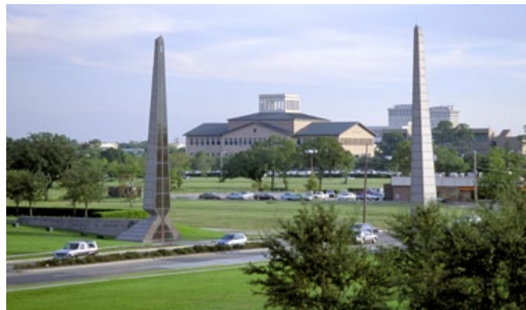
+ University of Houston, Cullen Boulevard Entry Houston, Texas