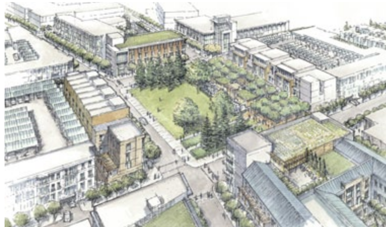
+ Cornell University East Hill Village Ithaca, New York