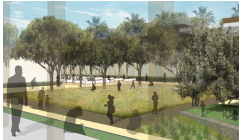
+ College of the Desert Multi-purpose Building Palm Desert, California