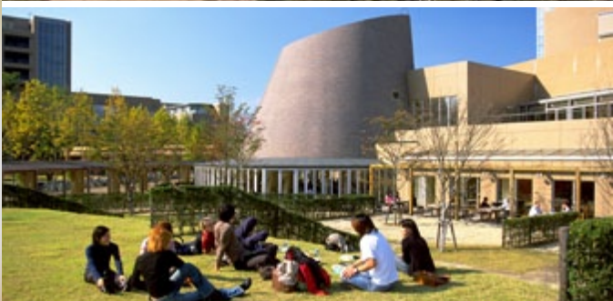
Tokyo University Foreign Studies Campus /// Fuchu, Japan

The Foreign Studies Campus of Tokyo University serves Japanese and foreign students pursuing a wide range of degrees in international studies and all aspects of world culture. SWA's master plan and design organized a clear, hierarchical landscape with a strong diagonal spine connecting from the adjacent town's retail center and transit station into the campus, through an entry plaza and a circular central plaza, past interconnected courtyards and gardens, and then to the student housing and playfields. The design sited buildings to preserve as many existing trees as possible, provided separation of pedestrian and vehicular circulation for the campus, and created contiguous open space throughout the campus to balance the small size (26.4 acres) of the campus.