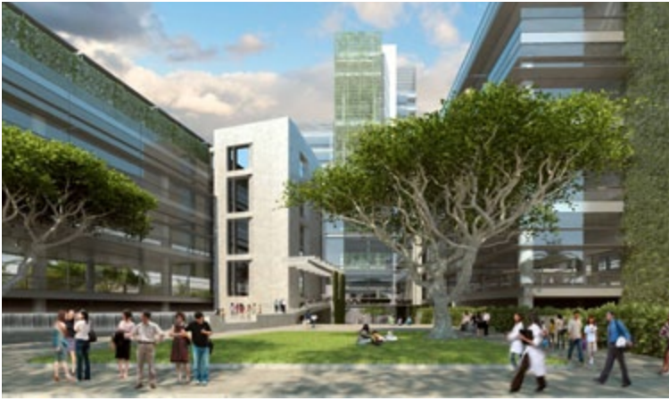
+ CREATE Campus National University of Singapore