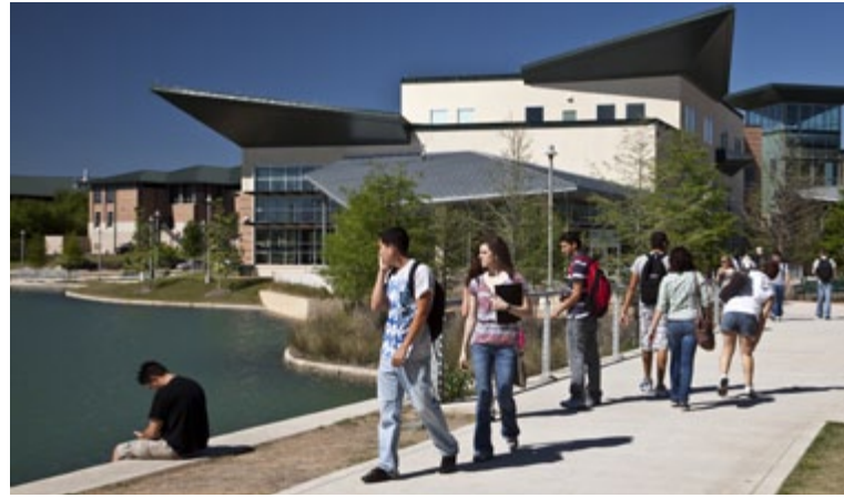
+ Northwest Vista College San Antonio, Texas