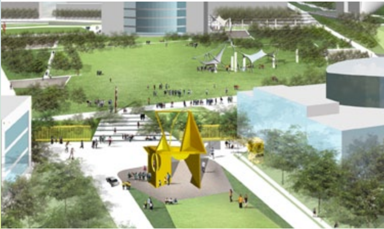
+ Universidad de Monterrey Master Plan Monterrey, Mexico