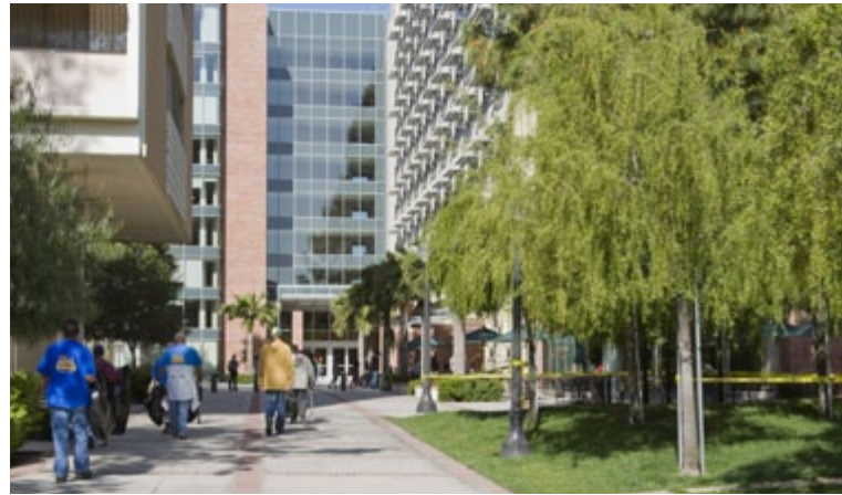
+ UCLA Northwest Campus Los Angeles, California