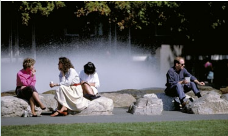
+ Harvard University Tanner Fountain Cambridge, Massachusetts