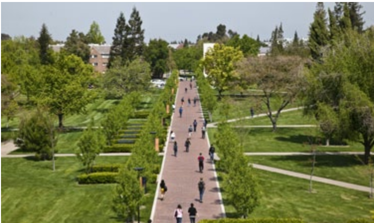
+ University of the Pacific Stockton, California